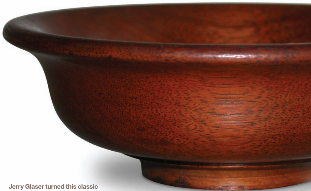
Jerry Glaser turned this classic 5\frac{1}{2} "-diameter walnut bowl in a junior high shop class in 1934.

In the mid-1980s, the partnership of Turnmaster ended, and the company became Glaser Engineering. About the same time, Jerry moved from wooden handles to the shock-absorbing metal handles filled with lead shot. The line of tools expanded to include a double articulating hollowing tool, grinding jig, screw chuck, and a wider variety of tools and specialty steels as described on page 21 .