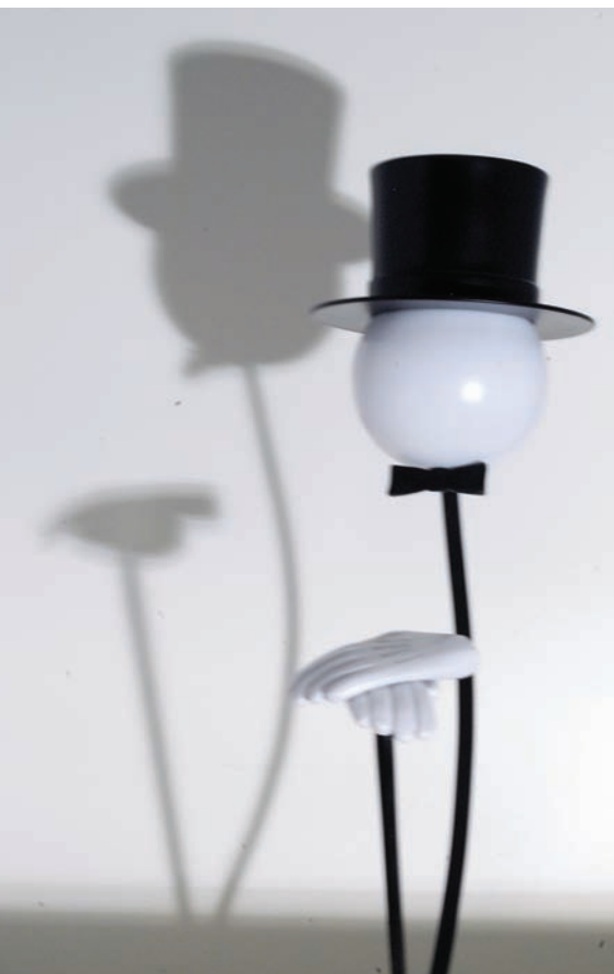
Formal Ball , 2012, Maple, cherry, 14" x 4" (36cm x 10cm)