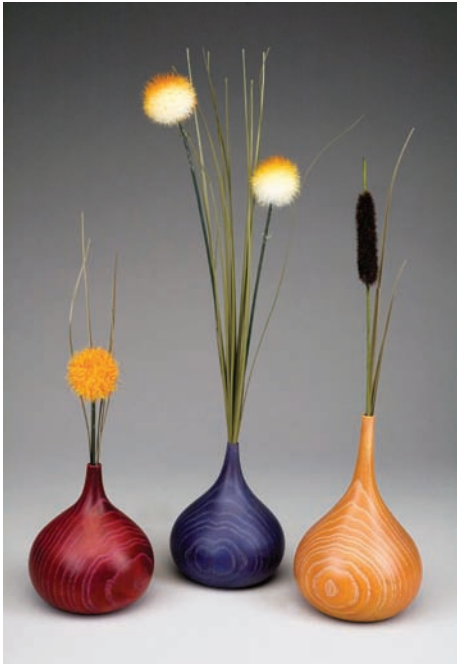
Tear Drops , 2008, Dyed ash, each about 5" x 3" (13cm x 8cm)