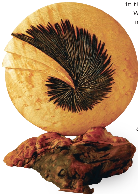
Spinning , 2011, Maple, manzanita root, 6" x 4½" (15cm x 11cm)