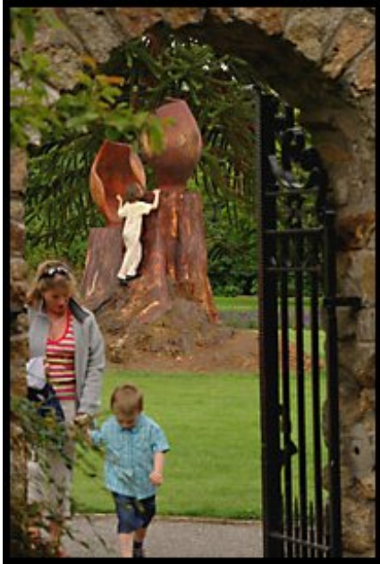
This sculpture, Brothers, was commissioned to commemorate the Irish patriot brothers Padraic and Willie Pearse

I enjoy history. I am writing a historical novel based on the history of my native place.