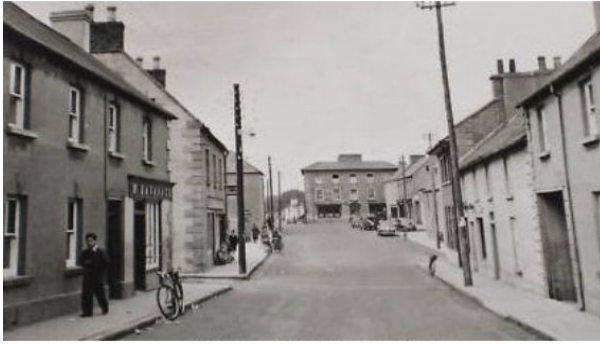
Bagenalstown, County Carlow, early 60s