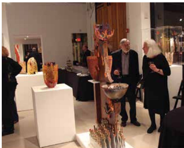
Shadow of the Turning: The Art of Binh Pho exhibition installation at The Center for Art in Wood, 2013.