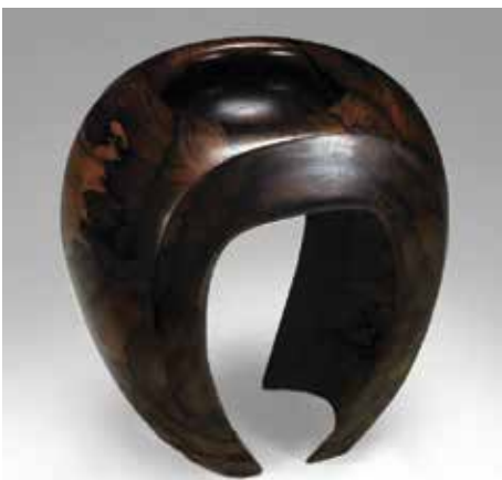
Suspended Vase Vessel , 1988, Zircote, 10" x 10" x 12" (25cm x 25cm x 30cm)