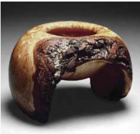
Suspended Vase Vessel , 1985, Maple, 10" x 10" (25cm x 25cm)

More recently, he has made either much larger pieces or sculpture comprising multiple objects. Green Eyed Girl/Blue Boy , Shibori , and Ribs serve as examples. These works and others made during this phase of his career approach a height of six feet and have allowed Lamar to explore the idea of a conversation between elements.