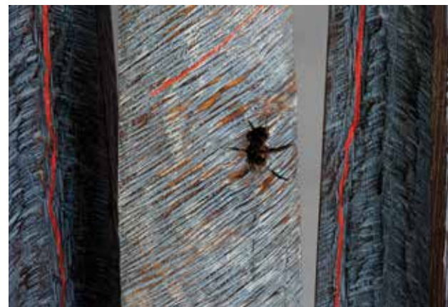
(Top) Shibori , 2012, White oak, steel, milk paint, 68" x 9" x 5" (173cm x 23cm x 13cm)