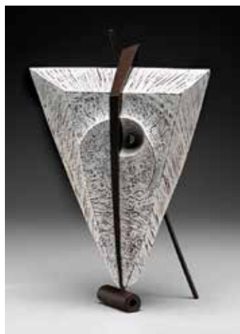
All Dressed Up , 2003, Madrone, steel, 22" x 14" x 5" (56cm x 36cm x 13cm)