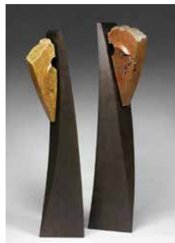
Green Eyed Girl/Blue Boy (Moroccan Children) , 2008, Madrone, largest: 53" x 17" x 12" (135cm x 43cm x 30cm)

Collection and photo courtesy of Arkansas Art Center Foundation