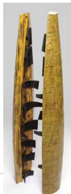
(Bottom) Ribs , 2017, White oak, steel, 52" x 5" x 11" (132cm x 13cm x 28cm)