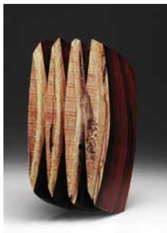
Addicted to Rhythm , 1996, Cocobolo, 10" x 8" x 5" (25cm x 20cm x 13cm)