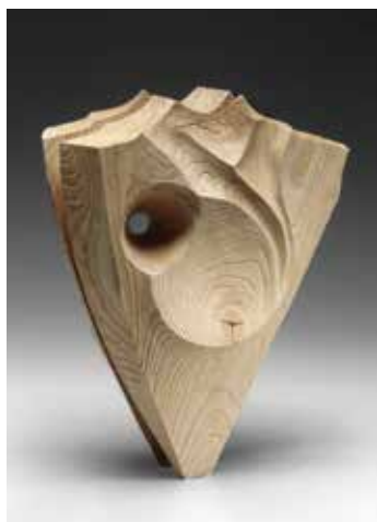
Torso for William Turnbull , 1997, Ash, 13" x 8" x 4" (33cm x 20cm x 10cm)